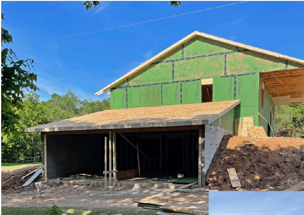
View from the west side with the carports.

Work continues on the new residence at Chaplin Nature Center. Most of the framing is done and work is commencing on all the details. But good progress is being made and everything is on schedule.