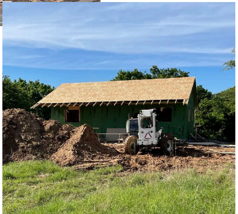
View from the east side