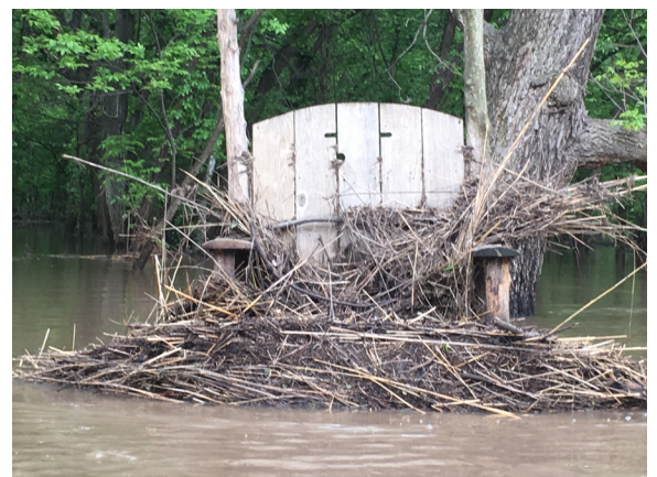
The Big Chair in the flood - but it survived!