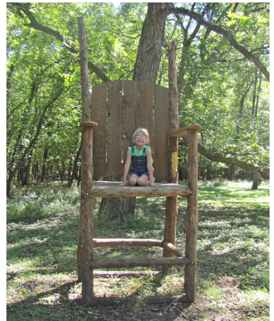
The Big Chair in better times