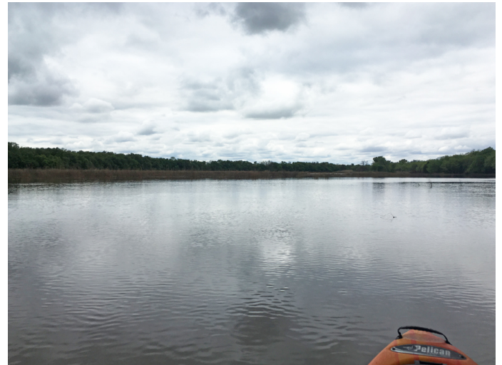
Lake CNC - the 52 acre lower prairie.

Approximately three quarters of the property at CNC is in the flood plain so flooding is expected from time to time. What made this spring different from past floods is when the water came up, it didn't go down. When the Arkansas River rose, it stayed above flood levels and the water covered much of CNC for over a week. The bad news is that many of our school groups had to cancel, the saturated soil caused trees to come down, lots of debris and trash ended up on the trails. The good news is that all bridges are still in place, the "big chair" didn't wash away, and the sandbar was reshaped in a way that makes it easier to find the trail heads. The clean-up has started; volunteers from Cowley County Community College and Boy Scout Troop 318 from Winfield will be working on the trails in June and July. Hopefully things will dry out in the next several weeks and all the trails can be completely cleared.