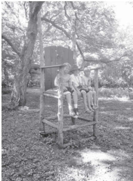
Some butterfly counters check out the Big Chair at CNC.

The 5th annual Arkansas City Butterfly Count was held on July 10th. This count uses the same count circle as the Arkansas City Christmas Bird Count and is an official count of the North American Butterfly Association. Ten adults and three kids helped us count. We had a good day for butterflies, with especially large numbers of Little Yellows and Dainty Sulphurs. Hackberry Emperors were the most numerous, as they are every year. We finished with a total of 744 individuals of 46 species. Mark your calendars for July 9th, 2011 and join in the fun.