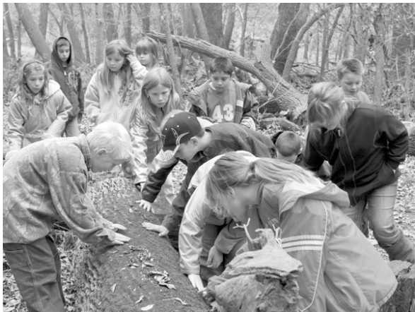
Students explore a fallen log at CNC.

The Wichita Audubon Society has received a grant of $11,000 from the Kansas Health Foundation in support of our nature education programs at Chaplin Nature Center. CNC was established because of an abiding belief that a connection to the natural world was an essential part of human physical and mental health. We are pleased to have that affirmed by this gift, and are excited by the opportunities it presents to continue our efforts.