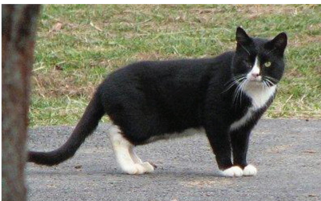
Figure 1. Feral cats roam freely across urban and rural areas.

Feral cats are domestic cats that have gone wild ( Figure 1 ). They cause significant losses to populations of native birds, small mammals, reptiles, and amphibians; can transmit several diseases such as rabies and toxoplasmosis; and may be a general nuisance. However, many people are sympathetic to feral cats and provide food and care for them. Managing feral cat populations is controversial. Before choosing a management strategy, it is important to understand public interest and research-based information regarding management options. This Extension Circular provides research-based information on the management of feral cats.