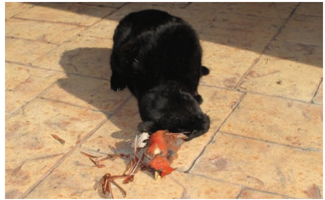
Figure 2. Feral cats prey on native wildlife.

Predation by cats on birds has an economic impact of more than $17 billion dollars per year in the U.S. The estimated cost per bird is $30, based on literature citing that bird watchers spend $.40 per bird observed, hunters spend $216 per bird shot, and bird rearers spend $800 per bird