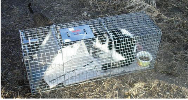
Figure 4. Cage trapping can be an easy and inexpensive way to capture feral cats. Once caught, they can be transferred to a veterinary clinic to be spayed, neutered, vaccinated, put up for adoption, or humanely euthanized.

opening about 10 by 12 inches (Figure 4). Traps should have ½- by ½-inch mesh and a wide handle guard to protect the handler and cat during transport. Solid-wall traps can be used instead of ½-inch mesh to protect the handler and provide cats with a sense of security. Ideally, one trap should be set for every cat on the site. Failure to use enough traps will lead to a longer capture period, and cats may learn to avoid traps.